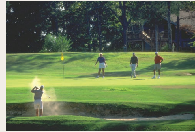
Pickwick Landing State Park Golf Course Park Road, Pickwick Dam, TN 3 [731] 689-3149 | [800] 250-8615

The Pickwick Landing State Park Golf Course is located close to the border of Mississippi and Alabama within the proximity of Pickwick Dam. The course was opened in May 1973 and is a favorite of the locals as well as destination golfers. Featuring Champion Bermuda greens and 419 Bermuda fairways, this course is almost always in championship condition and playable year-round.