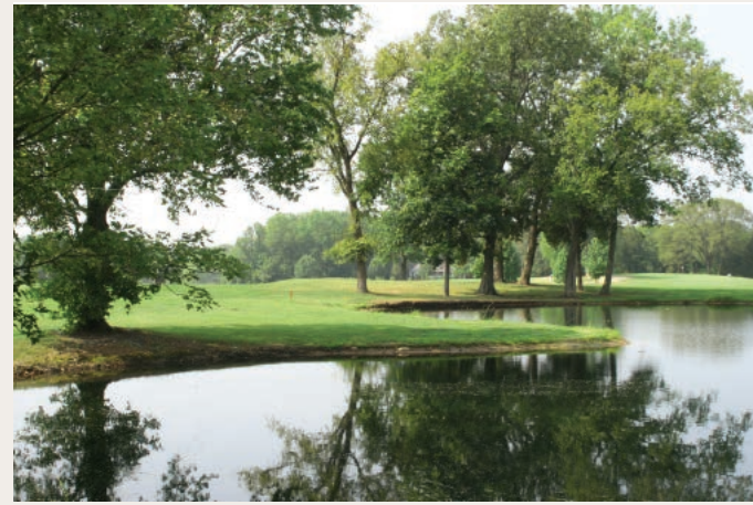
Henry Horton State Park Golf Course 4358 Nashville Hwy., Chapel Hill, TN [931] 364-2319 | [800] 250-8612

Henry Horton was the first state park golf course to be built in what would later become the Tennessee Golf Trail. Opened in the early 1960's, the Buford Ellington championship golf course at Henry Horton State Park is one of the finest courses in the state of Tennessee. This challenging course is heavily treed with hardwoods and measures 5,625 yards from the Forward tees and 7,060 yards from the Championship tees. The fairways are generous in width, the greens larger than average and three sets of tees to accommodate every skill level. And as always, a friendly staff is waiting to insure an enjoyable round of golf.