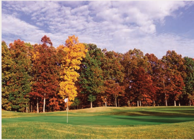
Fall Creek Falls State Park Golf Course 2009 Village Camp Road, Pikeville, TN [423] 881-5706 | [800] 250-8610

Fall Creek Falls State Park is home to a beautiful and challenging 18-hole championship golf course designed by renowned golf course architect Joe Lee. A 3-time selection by Golf Digest as one of the Top 100 Public Places to Play and honored as one of the top 25 public courses in America make this a truly wonderful golfing and wildlife experience.