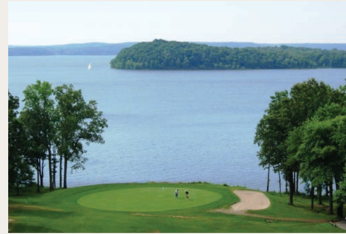
Paris Landing State Park Golf Course 16055 Hwy 79 N., Buchanan, TN [731] 641-4459 | [800] 250-8614

The Paris Landing State Park Golf Course is situated on the western shore of Kentucky Lake, located in the "Land Between the Lakes" area. The entire course is tree-lined, creating a feeling that you are the only one on the course, very rarely seeing another foursome. Several holes skirt Kentucky Lake, producing a natural balance of rolling land, trees, and water. Hole #12 is a 586-yard, par 5 with an elevated green overlooking Kentucky Lake and hole #4 is a downhill 186-yard par 3 with the water providing a scenic backdrop. The Paris Landing Golf Course is a great destination for year-round play.