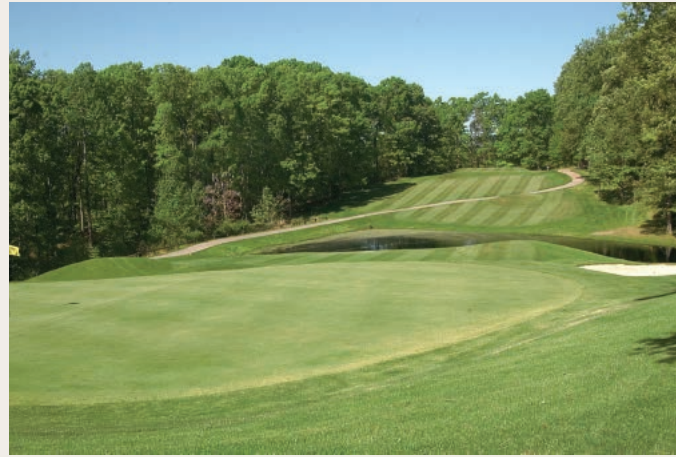
Montgomery Bell State Park Golf Course 800 Hotel Avenue, Burns, TN [615] 797-2578 | [800] 250-8613

With gently rolling hills and beautiful hardwoods throughout, the Montgomery Bell Golf Course is one of the hidden gems of Tennessee. Featuring Champion Bermuda greens and 419 Bermuda fairways, this is a wonderful experience for golfers year round. The property also features an abundance of wildlife such as deer, geese, and wild turkey. Each fall Montgomery Bell is host to the Dogwood Classic and our new clubhouse features a wonderful veranda for a casual lunch or seats up to 100 for outings or events.