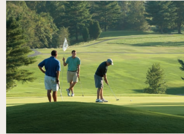
Warriors' Path State Park Golf Course 1687 Fall Creek Road Kingsport, TN [423] 323-4990

Warriors' Path Golf Course is an 18-hole course located on the shores of Fort Patrick Henry Lake and the foothills of the Appalachian Mountains. This course is one of the most popular in the Tennessee State Parks system. The par 72 course was designed by George Cobb and opened for play in 1972. It is along rolling countryside and has a scenic view of the lake from #5 tee. This course is a favorite of many golfers in the Tri-Cities area and also features a large practice facility complete with large teeing ground, practice green and practice bunker.